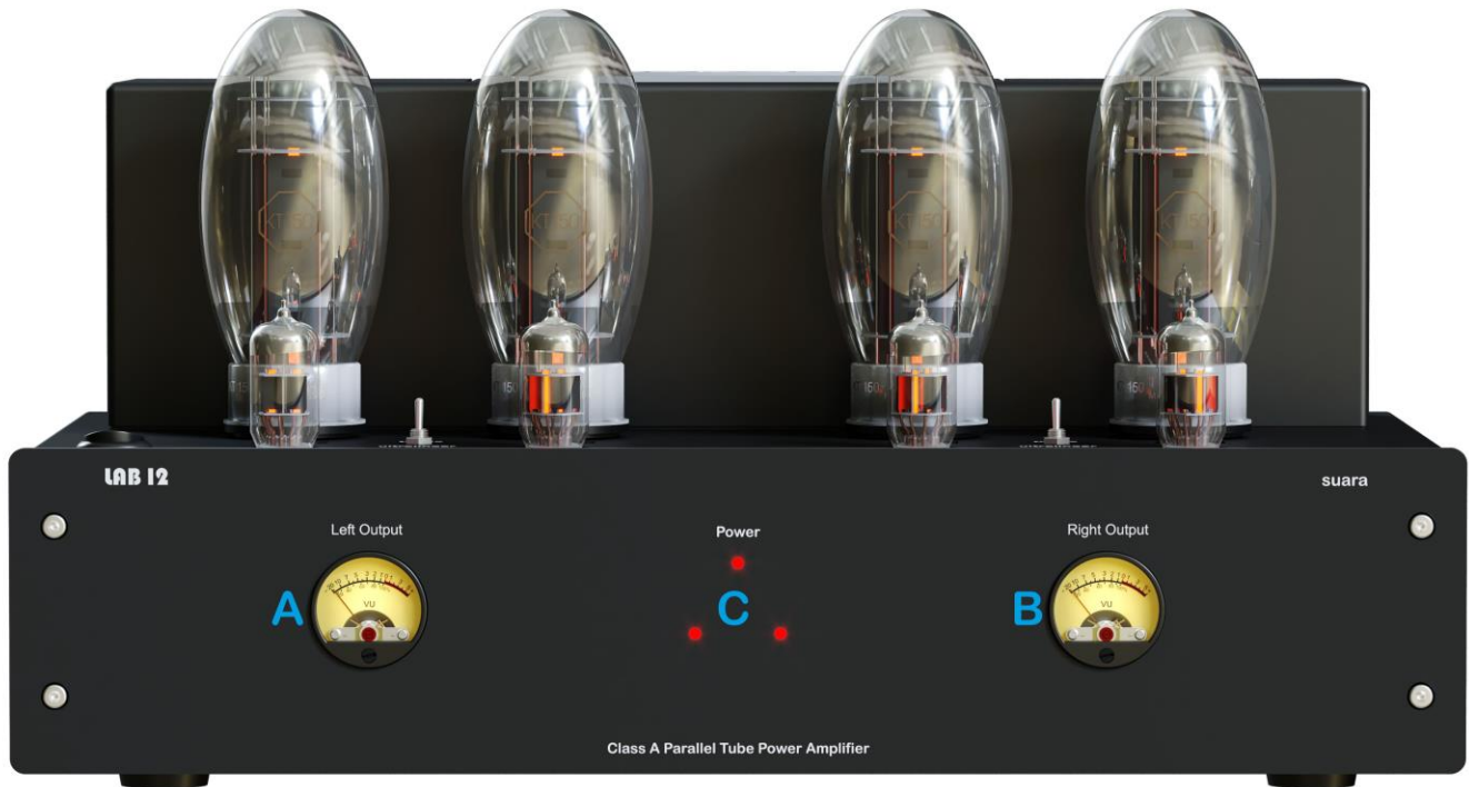
Suara Front panel

In the front panel you will see three indication LEDs and two VU meters.