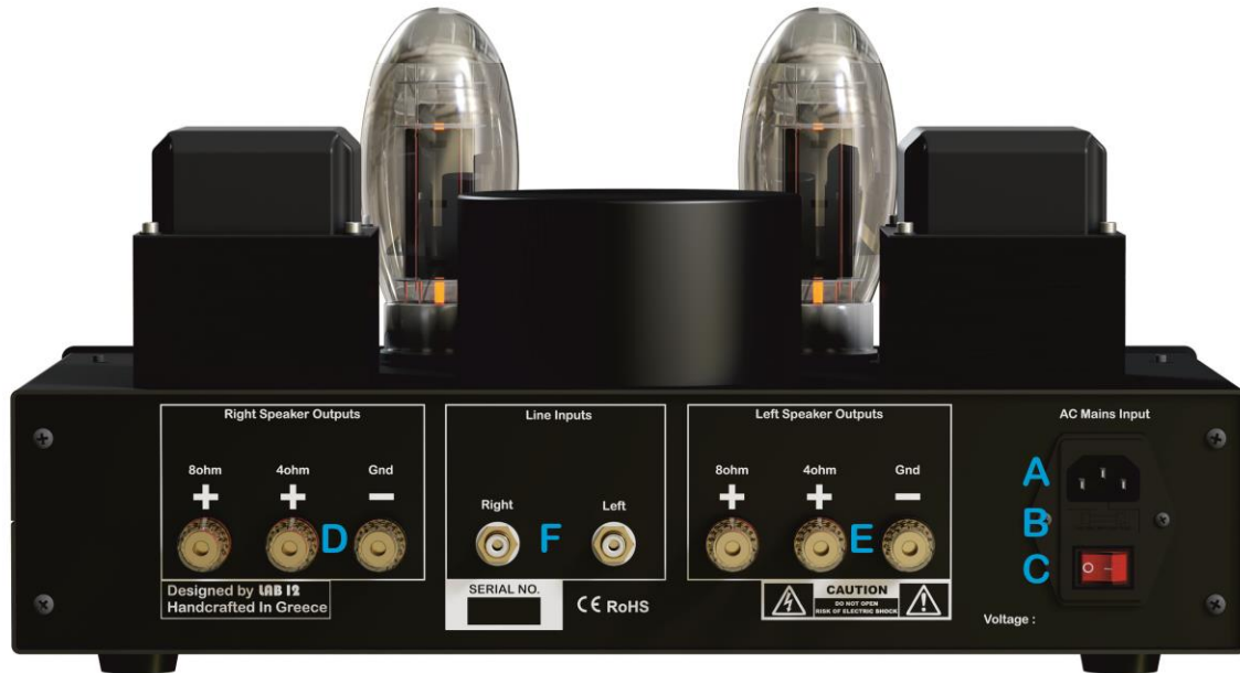
SUONO Rear panel

In the rear panel you will find the connection inputs and outputs.