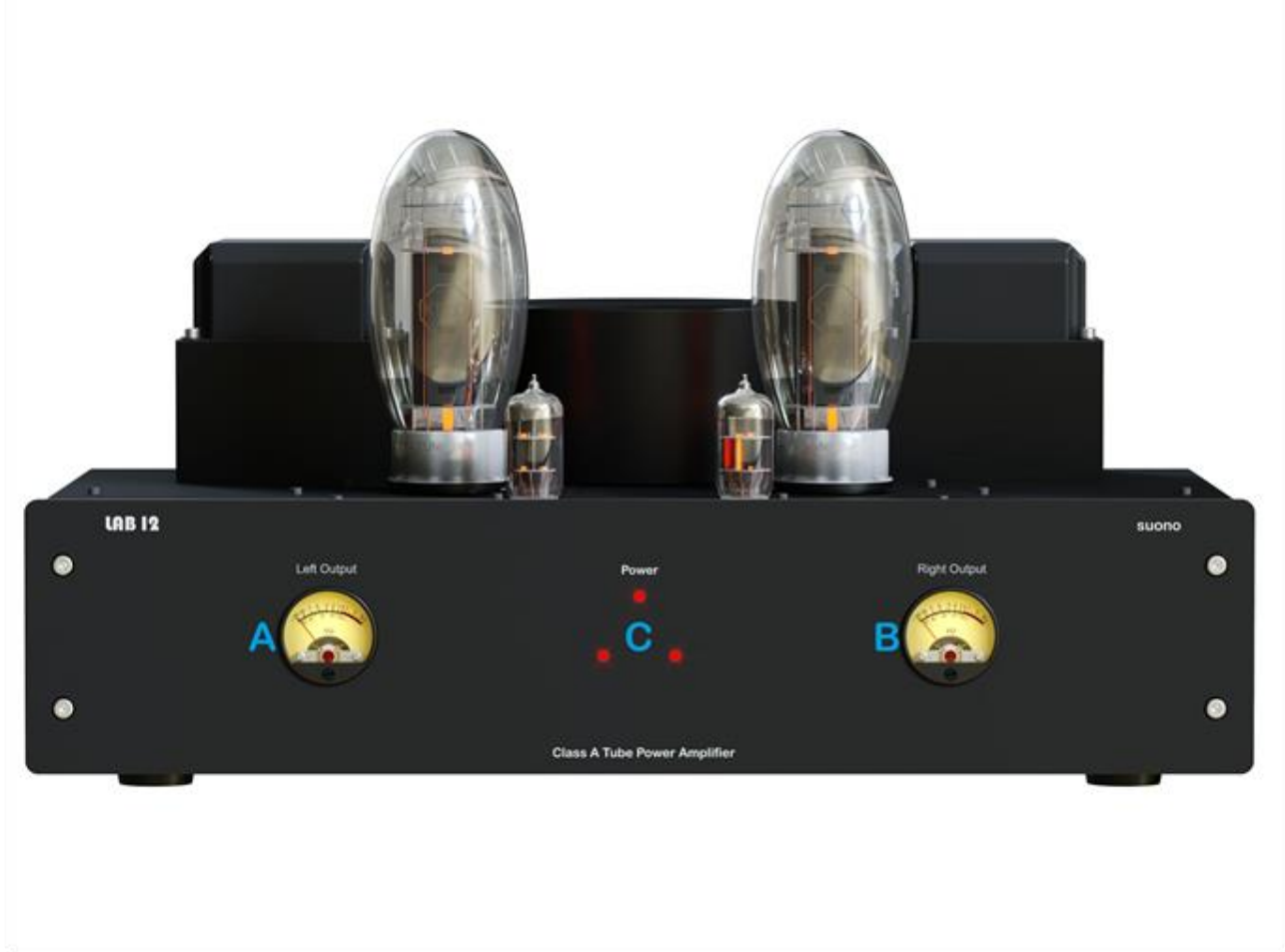
SUONO Front panel

In the front panel you will see three indication LEDs and two VU meters.