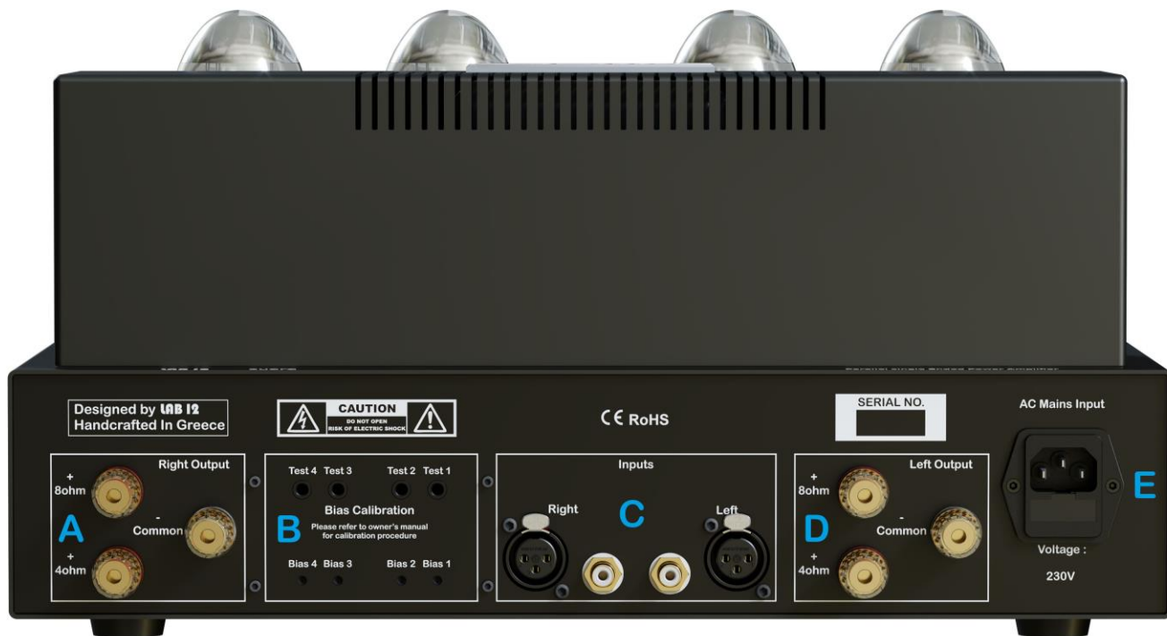
SUARA Rear panel

In rear panel you will find the connection inputs and outputs. To the right side you will find an IEC AC input including a main fuse holder ( E ).